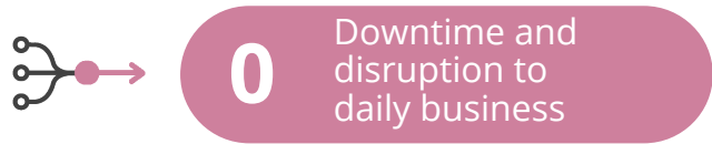
Figure 2. Hand & Stone Go-Live Cutover Data per Location

The Zenoti implementation team seamlessly moved data for each defined cluster (average cluster – 39 locations) to the respective spa location within Zenoti’s live site (Figure 2).