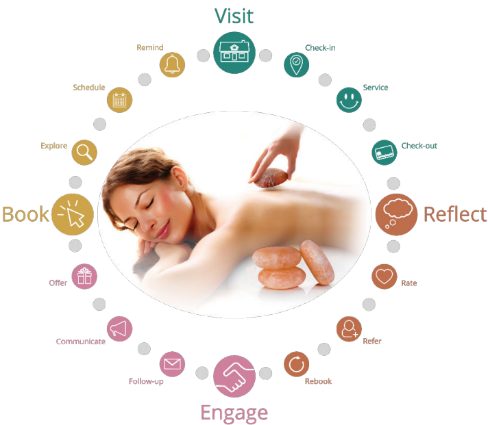
Figure 3. A Uniform and Consistent Guest Experience at Every Franchise Location.

Zenoti has proven experience transforming enterprise spa, salon and med-spa chains that create a lasting impact on owners, staff and guests. We did it for Hand & Stone Massage and Facial Spa and we can do it for you!